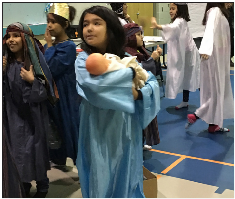
Acting out the Christmas story in Hall Lake, SK.

For unto us a child is born...Isaiah 9:6